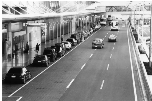
airport terminal / so

In this part, you can move to the next question by clicking on Next . If you want to return to a previous question, click on Back . You will have 8 minutes to complete this part of the test.